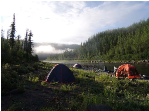
Fig.5 (left). Field camp. Tributary of Podkamennaya Tunguska River