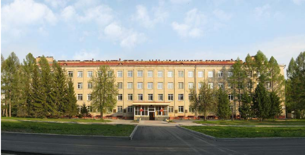
Fig.1. Main building of the Trofimuk Institute of Petroleum Geology and Geophysics, Siberian Branch of Russian Academy of Sciences