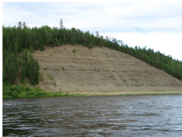
Fig.6 (right). Upper Ordovician cool-water carbonates with K-bentonite beds. Stolbovaya River

In July, the day temperature in this part of Siberia is usually between +17°C and +25°C. Occasionally could be rain. Participants are advised to bring field boots, warm sweaters, raincoats, umbrellas as well as caps and swimming suits. The tents, sleeping bags and other camp facilities including repellents against mosquitos will be provided by the organizers. Field trip fee (1500 Euro) covers guidebook, all meals, accommodation in field camps and transportation during the excursion. This field trip is restricted to minimum 10 and maximum 20 participants.