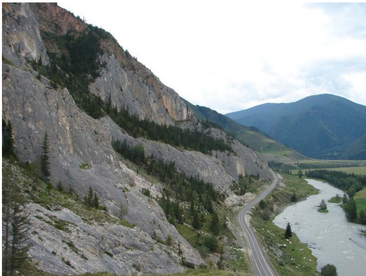
Fig.4. Upper Ordovician reef limestones, Gorny Altai

The field trip is planned to demonstrate the most important Ordovician localities of the Gorny Altai Mountains (Fig. 4 & frontispiece). Excursion starts and ends in Novosibirsk (Akademgorodok). The first and last days are mainly driving. Distance from Novosibirsk to the first field camp (tourist camping) in North-Western Altai is about 500 km. Transportation in the field will be by bus, 4WD tracks and jeeps. The Altai is usually called the Siberian Switzerland for its beauty but it is not high mountains. Altitude on the route of the excursion varies between 500 m and 1500 m above sea level. Mountains are covered by taiga forest and mountain meadows. Exposures are mainly along the river banks, road cuts, on mountain slopes and in active quarries. Participants of the excursion will have an opportunity to examine all the Ordovician succession of the Gorny Altai Mountains represented in different shallow to deep-water facies including: 1) delta front; 2) inner shelf (ramp); 3) inner slope of the carbonate platform; 4) central part and outer slope of the carbonate platform; 5) deep-water shelf; 6) continental slope; 7) open ocean deposits and sea mounts. Fossils are represented by graptolites, conodonts, chitinozoans, radiolarians, trilobites, ostracods, brachiopods, gastropods, crinoids, scolecodonts, tabulate and rugose corals, bryozoans and algae.