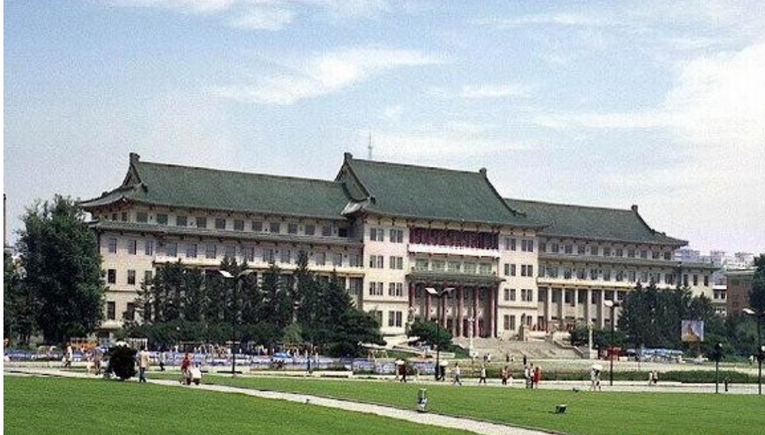
Geological palace of Jilin University

Changchun is well connected by air and by high speed train to Beijing, Shanghai, Guangzhou, Hong Kong and other provincial capital cities of China. The Organizers will arrange for students to meet you in Changchun airport or railway station if participants inform us in advance of your exact arrival date and time.