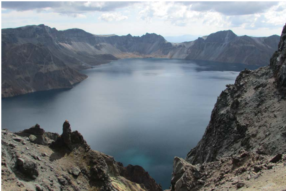
Tianchi in Changbai Mountains, located in the southeast of Jilin Province, is a lake in China and North Korea. Water up to 2150 m above sea level, is known as "the sky pond"