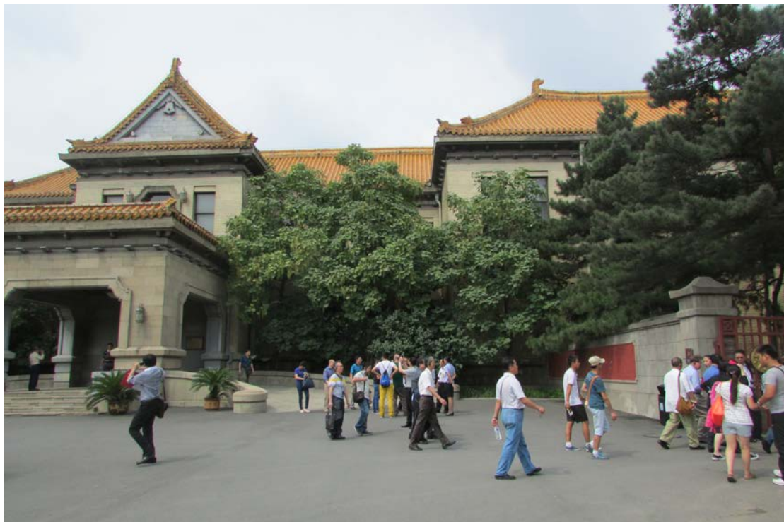
The last emperor's Palace